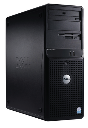
Dell PowerEdge SC440

The PowerEdge SC 440 server delivers affordable performance giving small businesses a server with room to grow as they do.